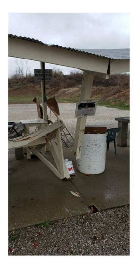
Oops. We had a mishap on bay 3. Too much gas... (if there is such a thing)