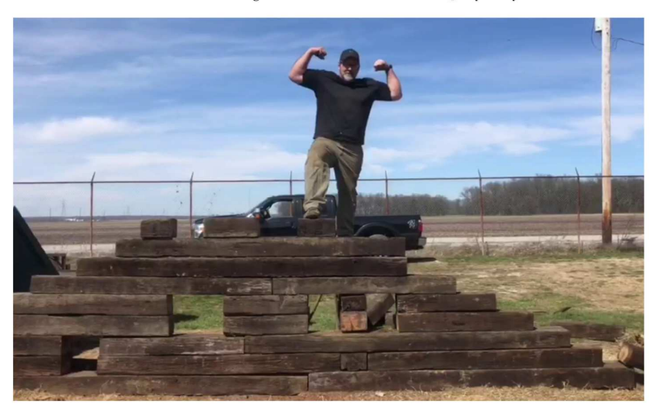
This will be a great prop for the Precision Rifle guys.